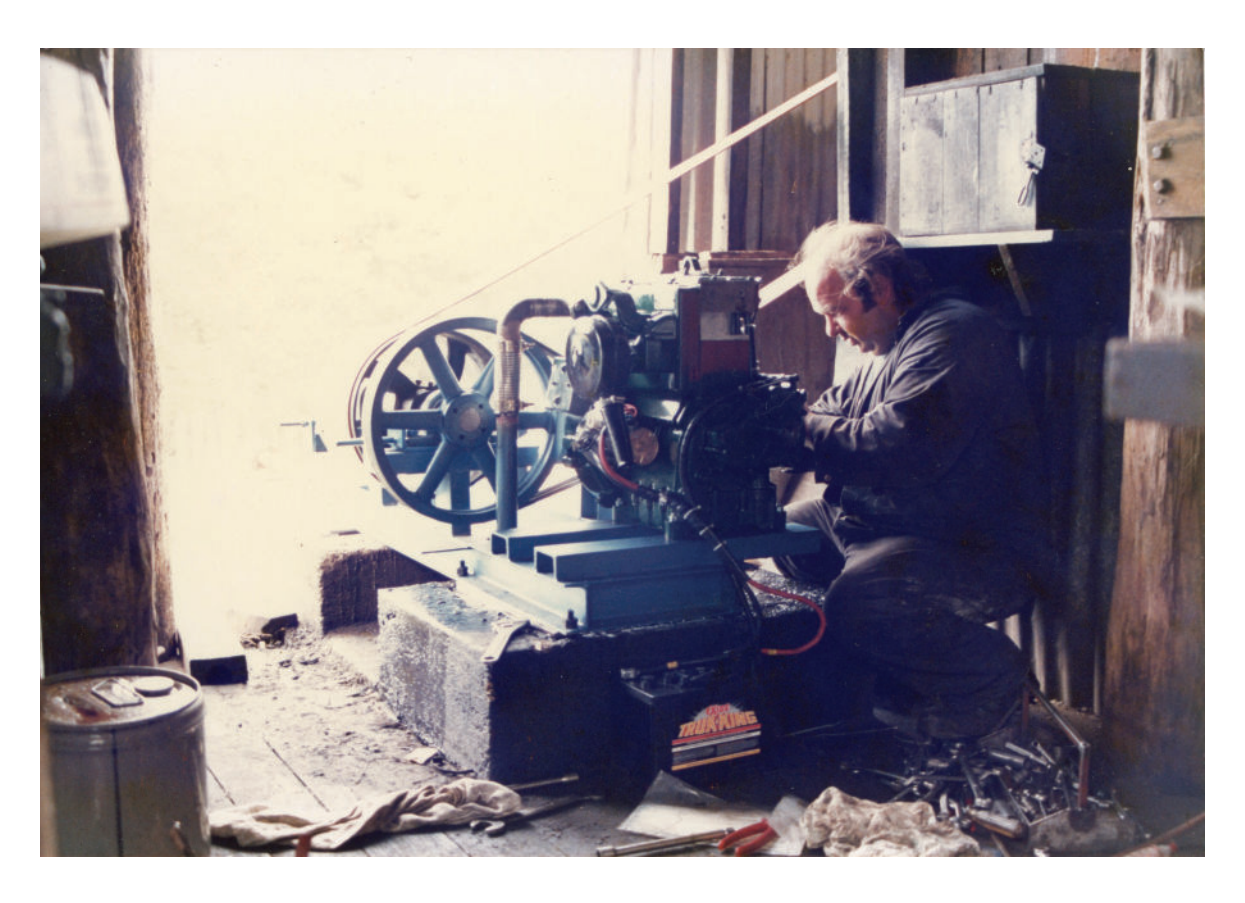
22 February 1948 – 19 April 2025